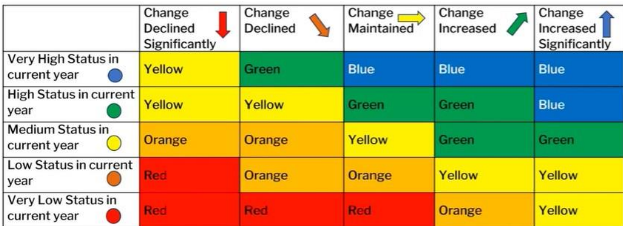
*5 x 5 table: Indicator Performance Rating - a color based on combination of Status and Change

For each state indicator, there are five Status Levels, ranging from Very High to Very Low and five Change Levels, ranging from Increased Significantly to Declined Significantly. Indicator color ratings are based on the combination of Status and Change using a 5 X 5 table.